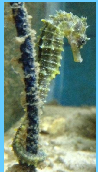
This Spiny Seahorse female was released back into the sea off Fowey in Cornwall.