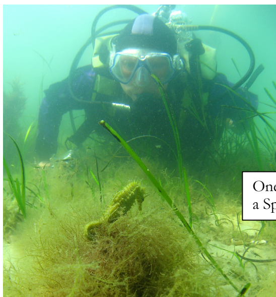
One of our volunteer divers studying a Spiny Seahorse at Studland