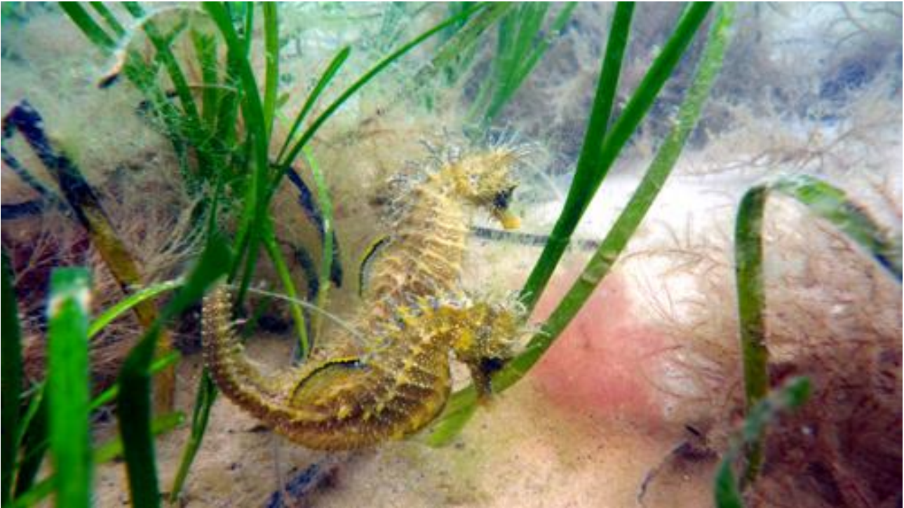
A pair of courting Spiny Seahorses, photographed at Studland Bay in Dorset during August 2012

By setting up a standing order you can regularly donate to the work of The Seahorse Trust, allowing us to plan research and conservation into the future and don't forget to Gift Aid your donations, it does not cost you anymore but it means we can claim back tax you have already paid.