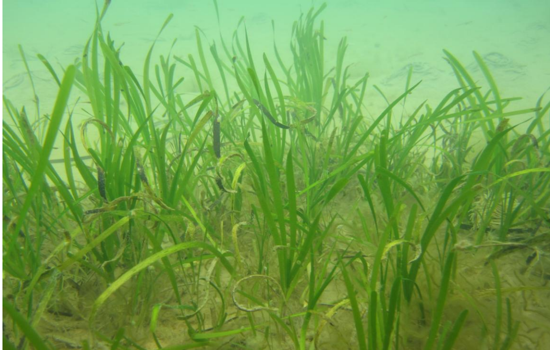
Fig. 2. Typical seagrass bed at Studland where the Spiny seahorses are found.

same day and dive session within a short period of time of each other by the same survey team working on the Studland Bay Tagging Project. This does not mean this was the date they returned from deeper water as they might have been there but not seen. However this site had been fully covered with survey teams a number of times. It is also known that seahorses move slowly over the seagrass meadow (known as transient animals) until they find a suitable site to set up a territory in. They are also known to move territories during the season should a disturbance happen making them feel unsafe in their territory.