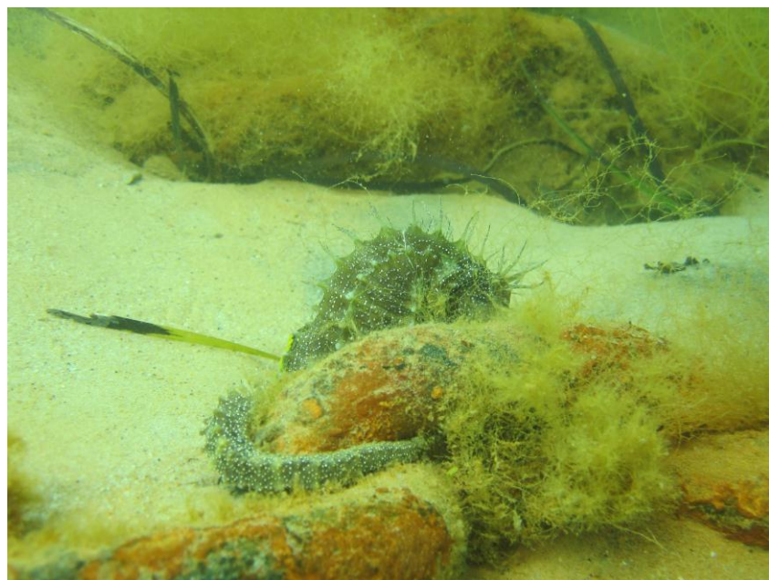
Fig 4 Female 053 hiding behind the mooring chain, her dark, almost black colouration indicates stress and her curled up body posture supports this.

There were a couple of occasions when the female and the male were found in an open patch; both looked highly stressed and the female in particular used the mooring chain to hide from prying eyes (see Fig 4.)