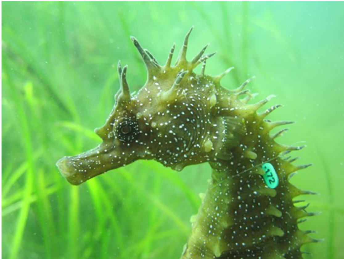
Fig 1 Spiny Seahorse ( Hippocampus guttulatus ) showing necklace tag (no.172) moved to the side for the purposes of identification; when not being read the tag lies under the neck out of the way and becomes difficult to see, so it does not interfere with the cryptic nature of the seahorse.

understanding about the ecology of the animals and their interaction with others, other species and their placement within the environment, and the habitats they occupy.